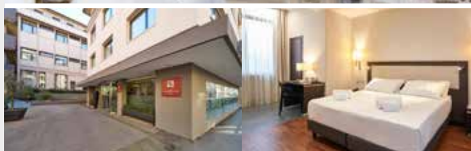
4* HOTEL LEONARDO DA VINCI