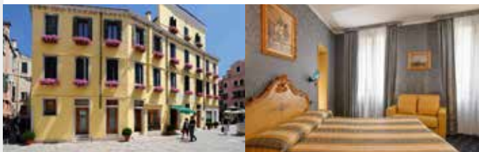
4* HOTEL SANTA MARINA VENICE