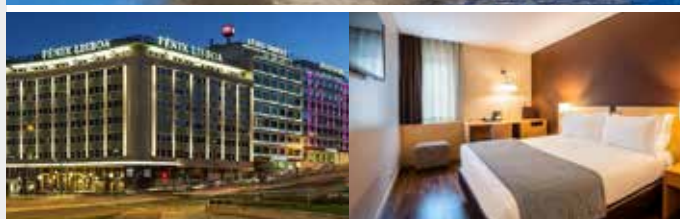
4* HOTEL FENIX URBAN